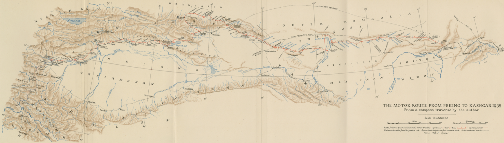
THE MOTOR ROUTE FROM PEKING TO KASHGAR 1935 From a compass traverse by the author