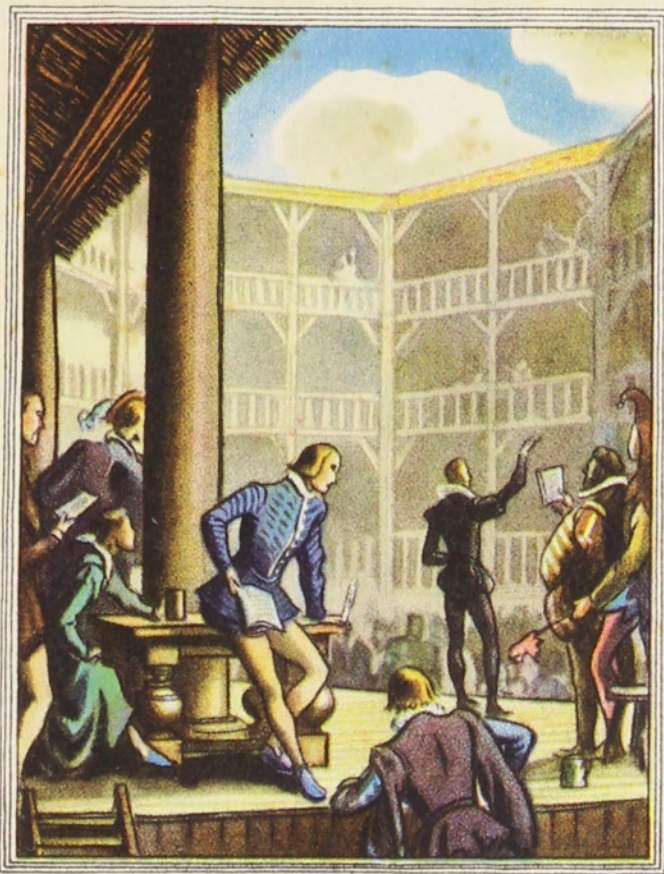
A Rehearsal of "Twelfth Night" at the Globe Theatre A.D. 1600